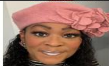
First Lady Princess McReynolds